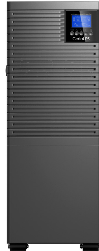
*Image shows 10kVA C550