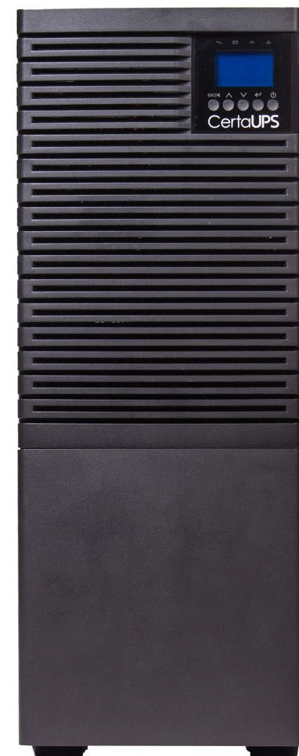
*Image shows 10kVA C650-B model