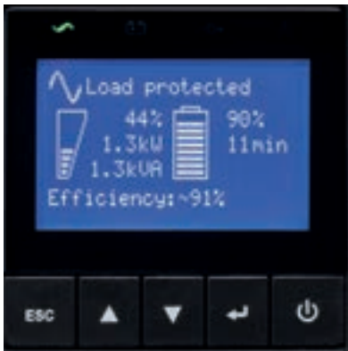
9SX graphical LCD