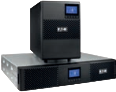
9SX Rack & Tower models