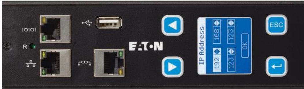
Figure 2. An advanced pixel LCD screen with pull-down interactive menu options on a rack PDU.

Of course, even the most agile environment is compromised if the prospect of downtime remains a persistent concern. Here, too, next-generation advanced-rack PDUs can have a significant impact. One drag on reliability is issues of IEC plug retention. It is not uncommon for plugs to get bumped loose in the rack, leading to server shutdown. A rack PDU with IEC plug retention prevents the accidental dislodgment of a plug and can greatly enhance reliability. There are several methods to secure the plug, but a solution integrated into the outlet is ideal to avoid the bulk of external clips or cable trays. It is also important to avoid solutions that require proprietary power cord solutions that involve additional expenses to the tune of 20-50%. On the other hand, an integrated IEC outlet grip reduces the total cost of ownership and improves reliability.