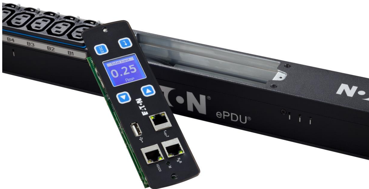
Figure 4. A hot-swap network meter card minimizes downtime on a rack PDU.

Meter accuracy on next-generation rack PDUs has improved to within \pm 1\% of actual value, which is known as billing grade accuracy. This is a significant improvement over legacy models, which primarily used meters for load balancing. With such a high level of accuracy, data centers are able to effectively measure power usage to all outlets, enabling department billing as well as the ability to track usage for local utility rebate programs. Billing grade accuracy may be especially important to co-located data centers, which can use these measurements for tenant power billing. In addition, the meter on next-generation rack PDUs can still be used for load balancing and helps data center operators identify open capacity.