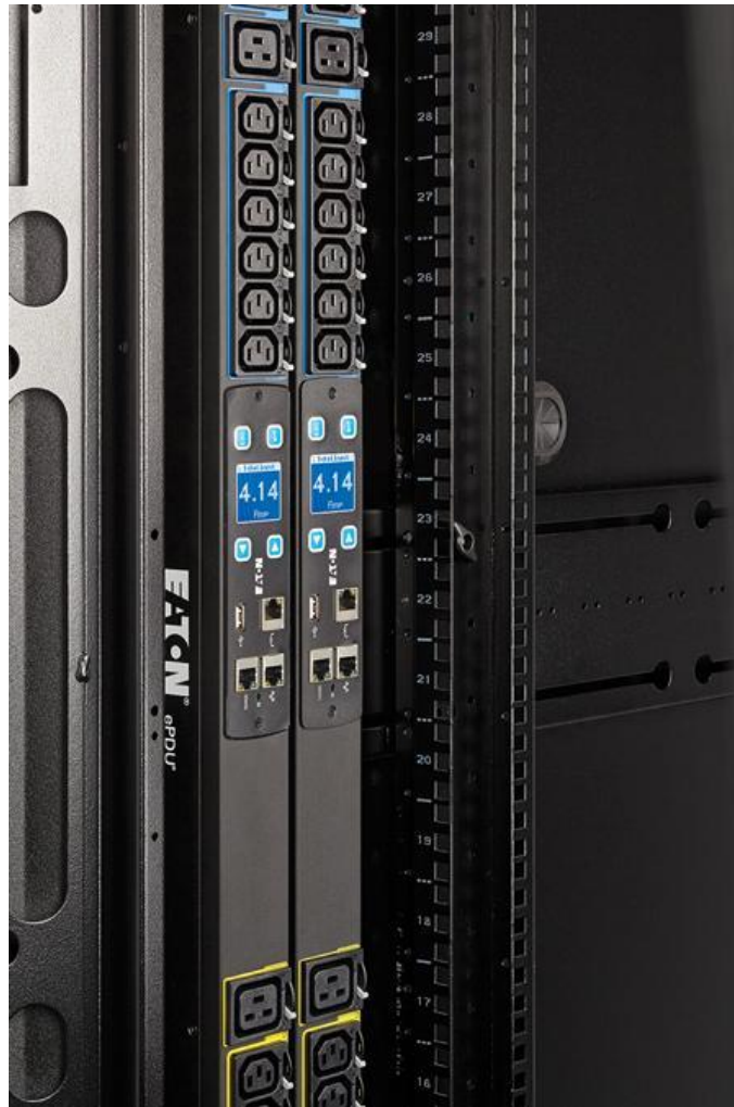
Figure 1. Rack PDUs with racks from the same vendor ensure compatibility, which enables agility in the data center.

The best way to facilitate agility: make sure a vendor can provide both the rack and the PDU. Compatibility goes a long way to ensure ease of use and optimize the way the two components work together.